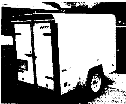
Coastie's New Pace House