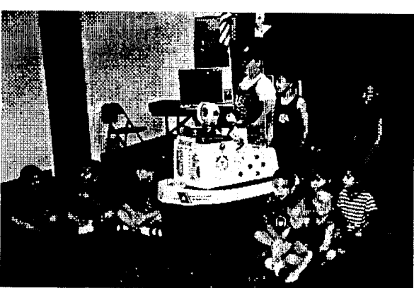
Coastie and Friends at Muldrow Library