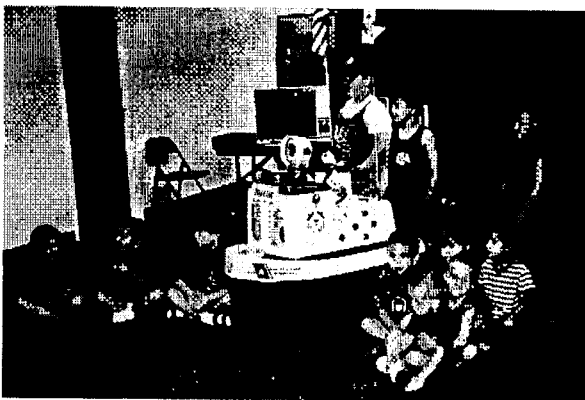
Coastie and Friends at Muldrow Library