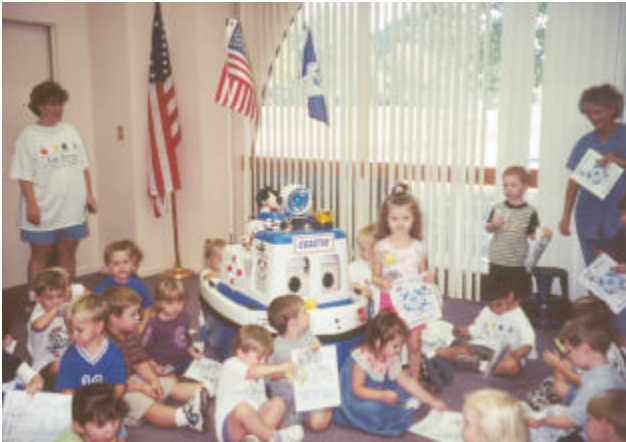
Coastie and friends at Stanley Tubbs Library in Sallisaw

teacher and has been about 30 years, so she must be pretty good. She teaches in JJ IZARD Elementary in Van Buren. She invited me to be the special guest speaker for her Friday morning sunrise show. They put me on the stage and closed the curtains, I could hear kids coming in. When they opened those curtains and I saw all those 351 kids sitting side by side in the floor, Well let me tell you it looked like an ocean of little faces. All smiling and looking at me.