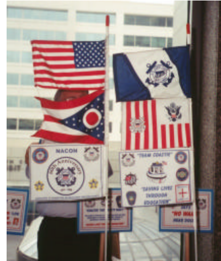
Coastie 01 flags at NACON