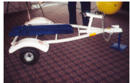
Coastie 01's boat trailer